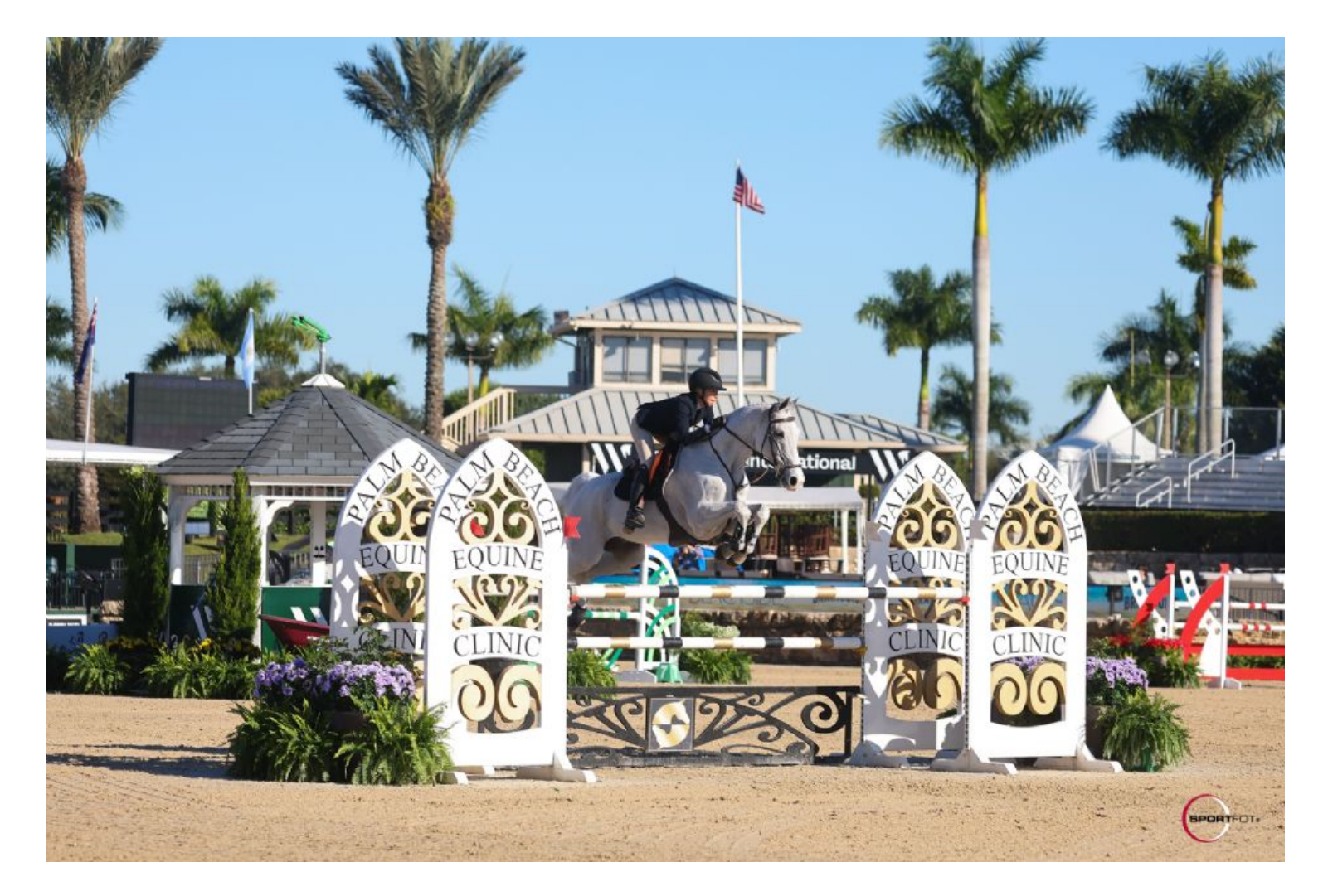
PBEC Photo of the Week From the Winter Equestrian Festival

Palm Beach Equine Clinic's facility is expanding! Plans include doubling the size of the hospital barn to accommodate more patients. This addition will include six more stalls as well as a feed room. The first segment of the project is underway and will be completed in January 2023.